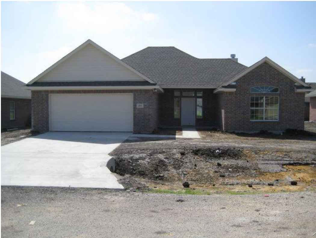
111 Palomino Palmer, TX.